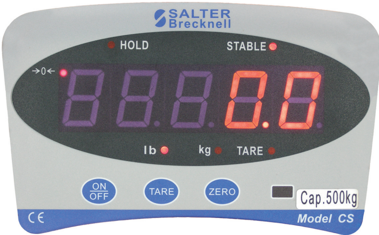
Figure 1.1 Model CS front panel

Figure 1.1 shows the front panel of the scale.