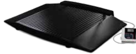
Dual Ramp Wheelchair Platform Model 350-10-8