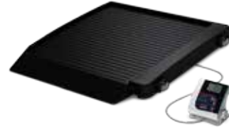
Wheelchair Platform Scale Model 350-10-7