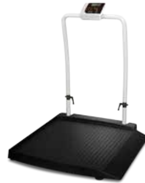
Wheelchair Scale Model 350-10-2