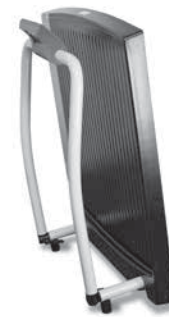
Wheelchair scale in folded position