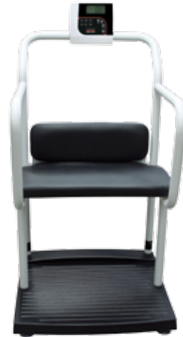
Bariatric/Handrail with Chair Seat Model 250-10-4