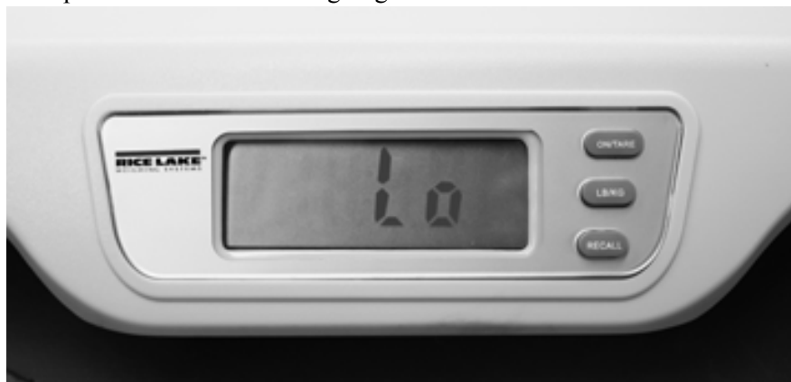
Figure 2-2. Low Battery Indicator

The RL-DBS Digital Baby Scale is also capable of running on four (4) AA batteries if no additional power source is available. If the Lo prompt is showing on the display, replace the battery or connect the scale to an AC power source as soon as possible for accurate weighing.