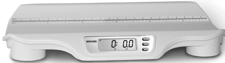
Figure 1-1. RL-DBS Digital Baby Scale

This manual can be viewed and downloaded from the Rice Lake Weighing Systems web site at www.ricelake.com/health . Rice Lake Weighing Systems is an ISO 9001 registered company.