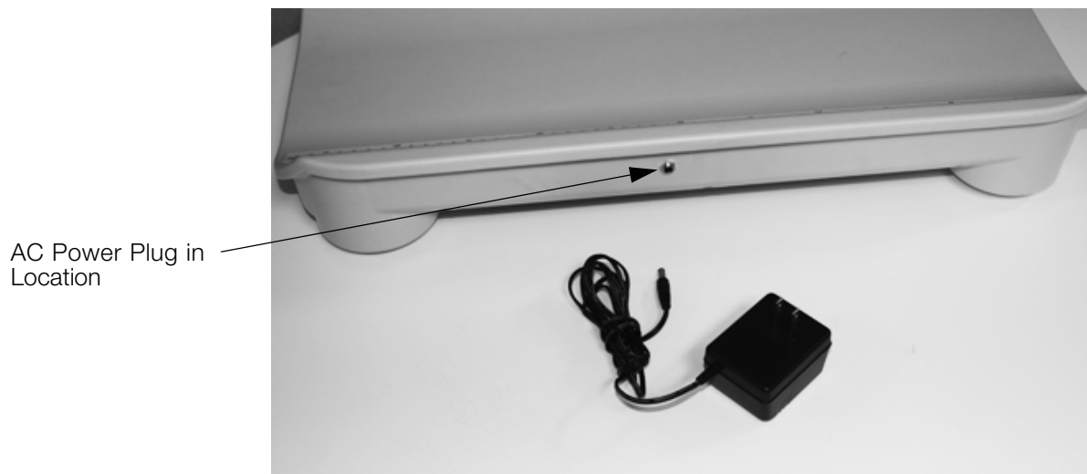
Figure 2-1. AC Power Connection Site

The RL-DBS Digital Baby Scale is also capable of running on four (4) AA batteries if no additional power source is available. If the Lo prompt is showing on the display, replace the battery or connect the scale to an AC power source as soon as possible for accurate weighing.