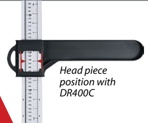
Head piece position with DR400C