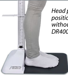
Head piece position without DR400C