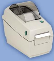
Detecto Model P220 Label Printer