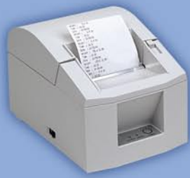
Detecto Model P185 Tape Printer

PRINT WEIGHT, ID, BODY MASS INDEX, TIME, DATE, AND HEIGHT