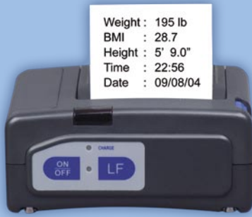
MODEL P150 MOBILE TAPE PRINTER