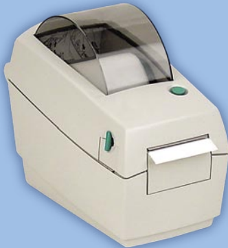
MODEL P220 LABEL PRINTER