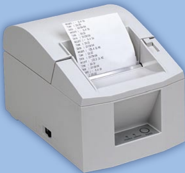
MODEL P185 TAPE PRINTER