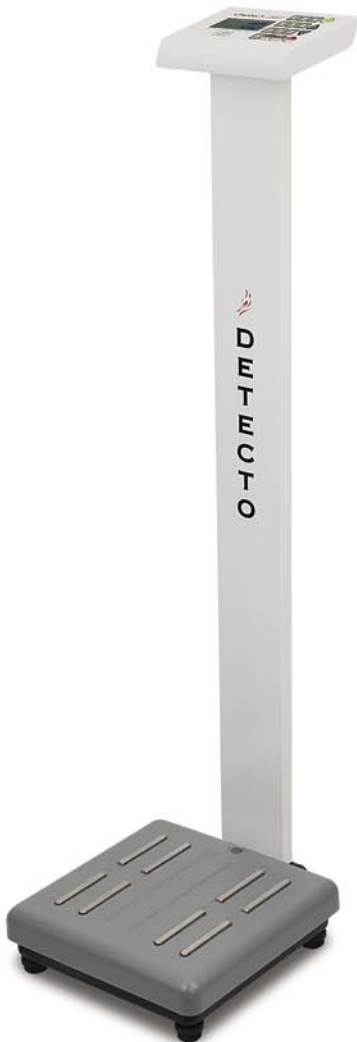
Model PD350 Eye-Level Physician Scale with Body Fat Analysis

The optional P50 printer may be mounted on any of the ProDoc® PD350 series eye-level physician scales to print Time, Date, Height, Weight, Age, Gender, Activity Level, BMI, Body Fat, Body Water, Bone Mass, and Muscle Mass.