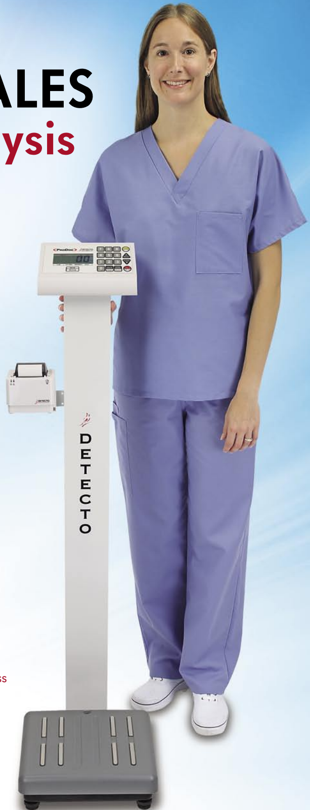
Detecto PD350 Physician Scale with Body Fat Analysis Shown with Optional P50 Printer

Detecto's ProDoc® Series Digital Physician Scales with Body Fat Analysis offer medical-grade accuracy and durability from the brand you trust in clinical weighing at an economical price. These scales use the method of Bioelectrical Impedance Analysis to estimate body fat, total body water, bone mass and muscle mass percentages. The body fat scale is also equipped with an "Athlete Mode" for athletes whose body build is different from non-athletes.