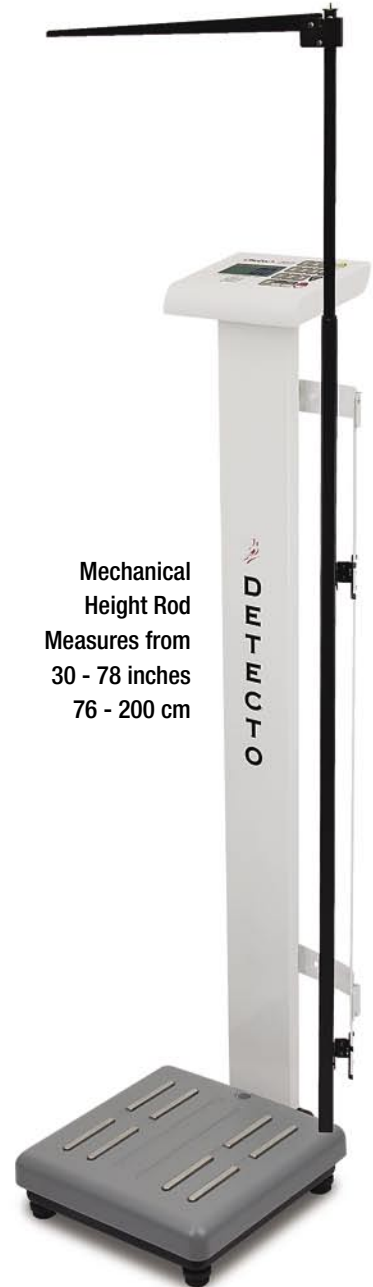
Model PD350MHR Eye-Level Physician Scale with BFA and Mechanical Height Rod