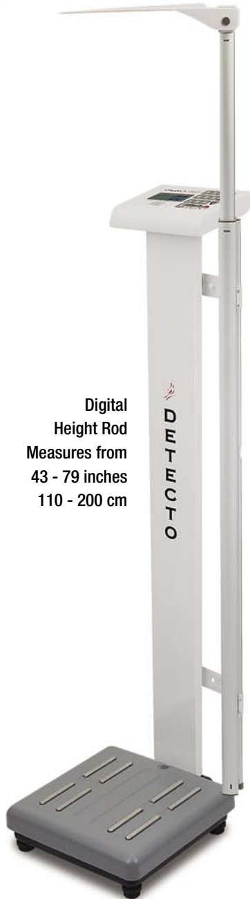
Model PD350DHR Eye-Level Physician Scale with BFA and Digital Height Rod