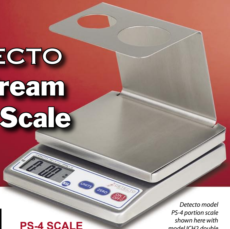
Detecto model PS-4 portion scale shown here with model ICH2 double ice cream cone holder.