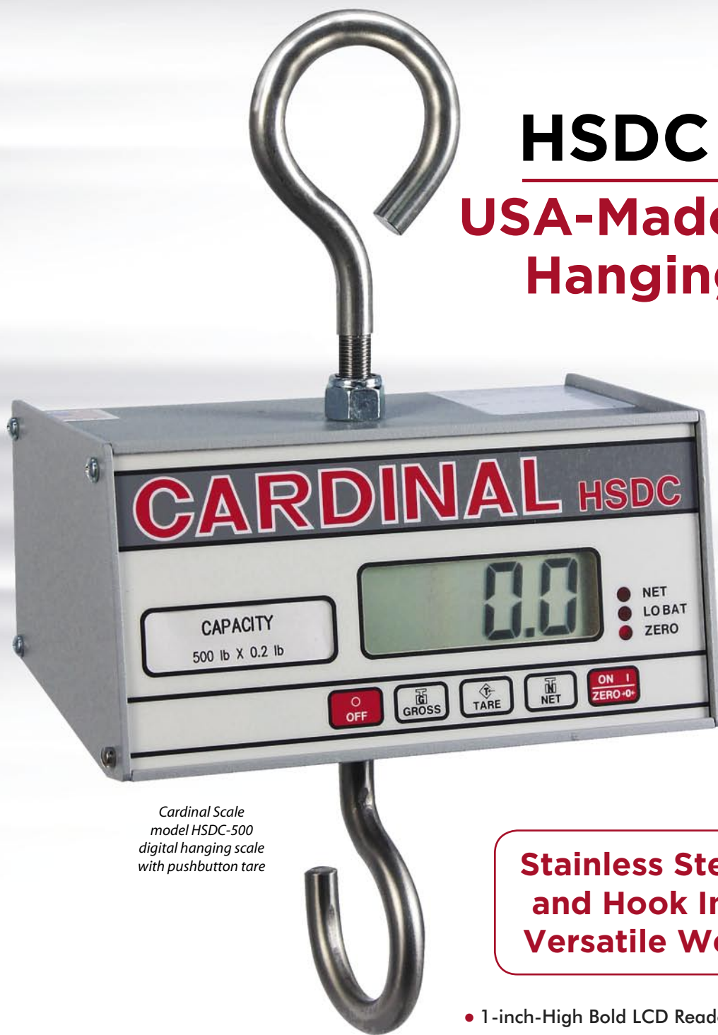
Cardinal Scale model HSDC-500 digital hanging scale with pushbutton tare