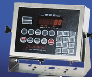
EB-300 with 210 Indicator