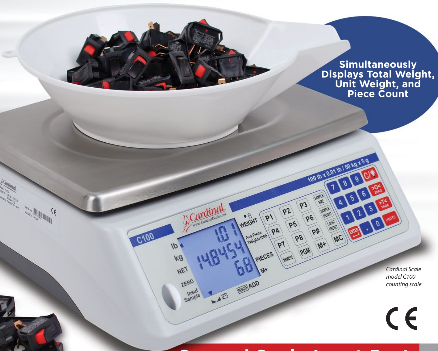
Cardinal Scale model C100 counting scale