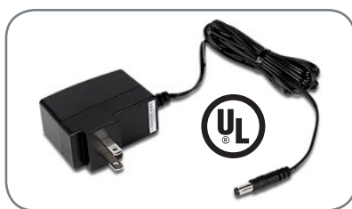
AC adapter included (UL listed for the U.S. and Canada)