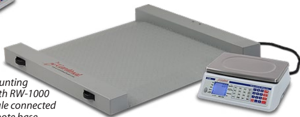
C100 counting scale with RW-1000 floor scale connected as a remote base