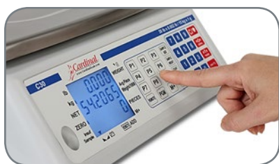
Product look up preset keys speed counting operations

Cardinal Scale's C series scales with rechargeable battery are ideal for inventory counting where mobility is a must! These durable counting scales feature a full keypad to enter and recall known piece weights and tare weights, metric conversion, large backlit single LCD, bubble level, and non-skid feet for stability.