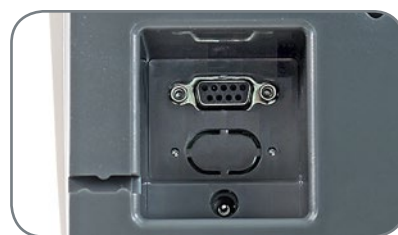
Includes second scale input port (remote scale only)