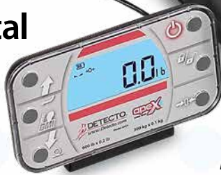
DETECTO Model APEX-RI

These digital flat scales let the patient weighing come to you!