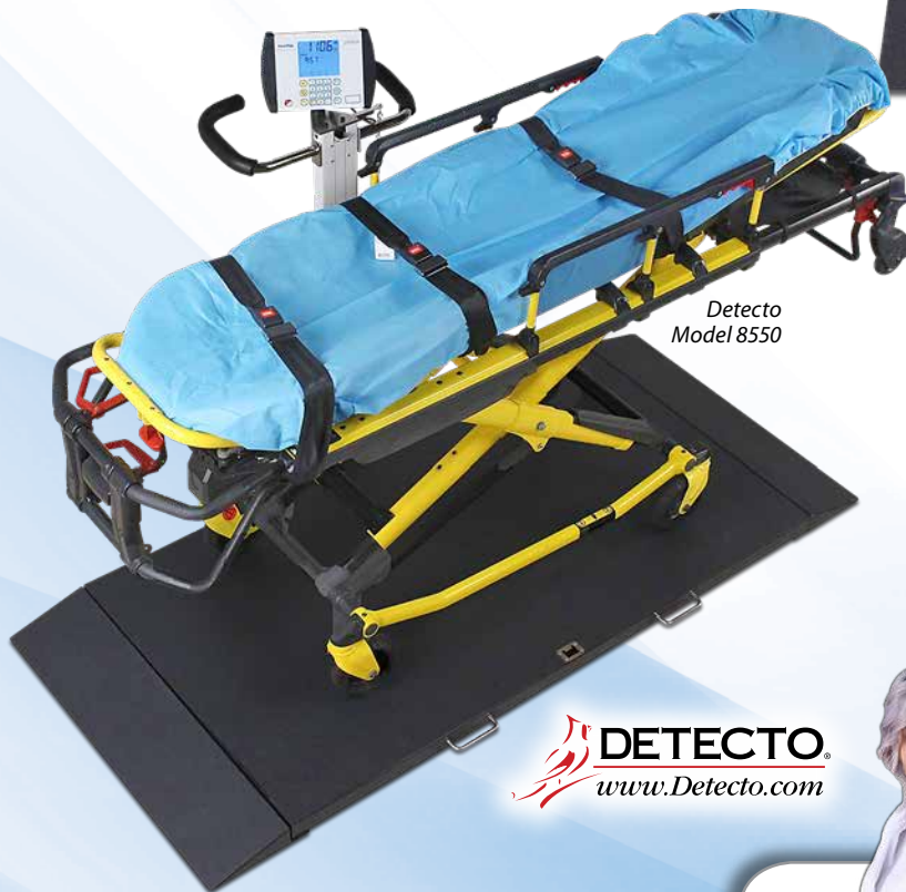
Detecto Model 8550