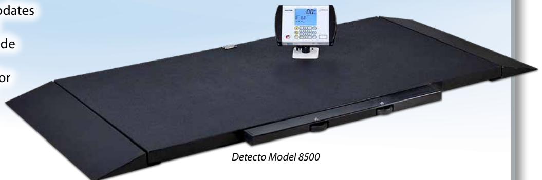
Detecto Model 8500