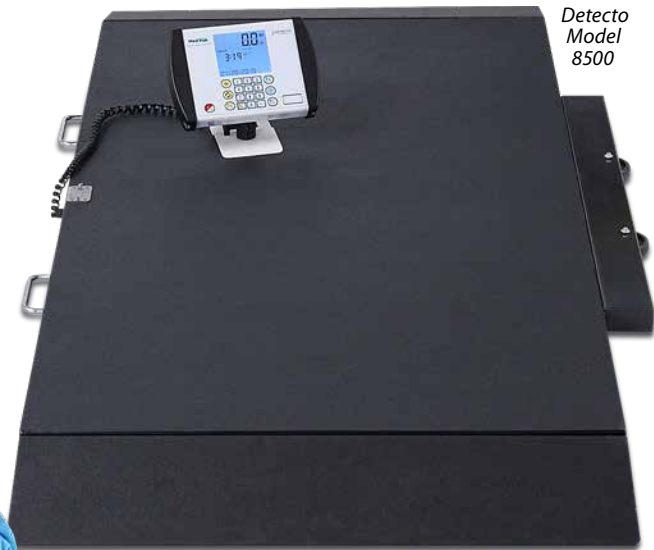
Detecto Model 8500