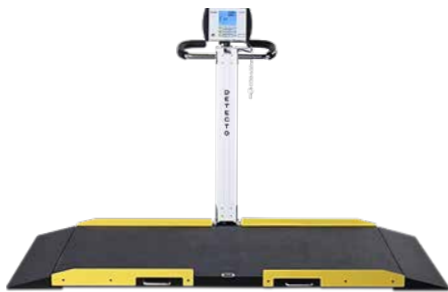
DETECTO model 8550 shown with optional yellow guide rails