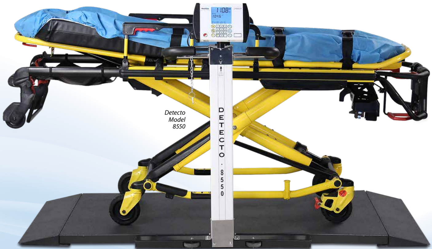
Detecto Model 8550