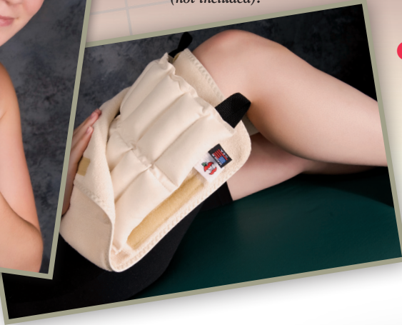
Pictured Below: Standard #500 with Foam Fill Cover #854 (not included).