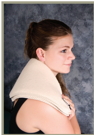
Pictured above: Neck Contour #501 with Foam Fill Cover #856 (not included).

For infrequent use, conditioned Thermal Core Packs can be stored in the freezer.