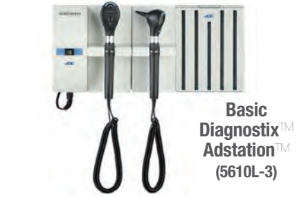
Basic Diagnostic™ Adstation™ (5610L-3)