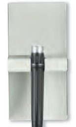
Diagnostix™ Adstation™ Wall Extension Module