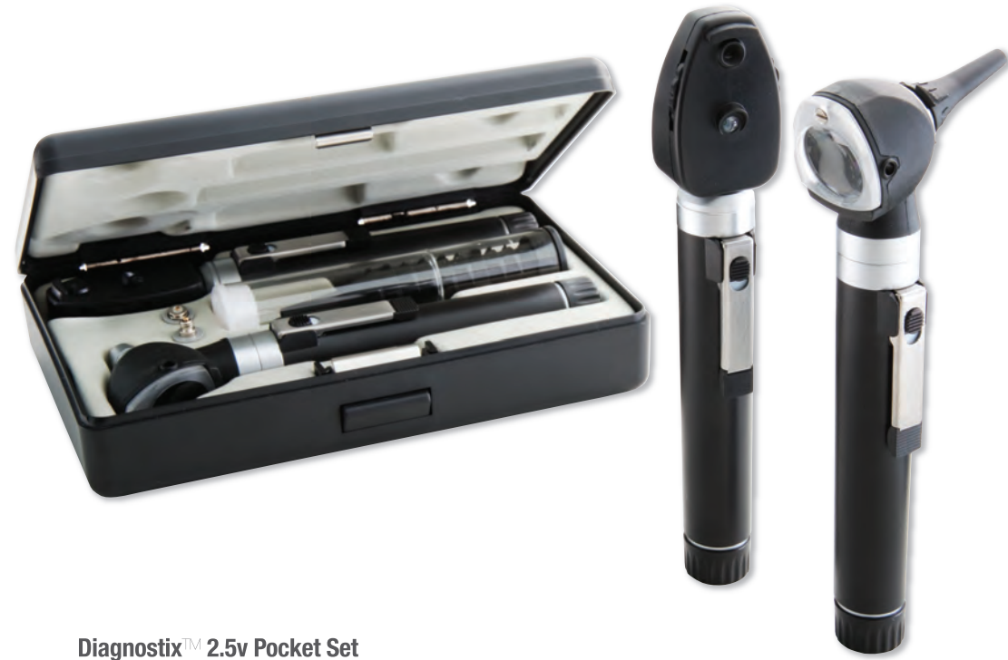
Diagnostix™ 2.5v Pocket Set

(page 6) and 2.5v Pocket Ophthalmoscope (page 7) instrument heads. Xenon illumination provides bright white light and true tissue color. Instruments available individually or in complete two instrument diagnostic sets. Offered in either hard fitted or soft nylon storage case, "AA" batteries included. Disposable specula included with Otoscopes. Spare lamps included (except 5110E). Components manufactured in Dubai, China and Taiwan. Inspected, assembled and packaged in the USA. 2 year instrument warranty, lifetime on optics.