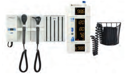
Diagnostic™ Adstation™ with Advview™ (5610L-39W)