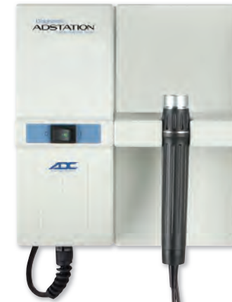
Diagnostix™ Adstation™ Wall Transformer