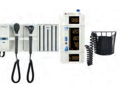
Diagnostix™ Adstation ■ with Adview (5610L-39W)