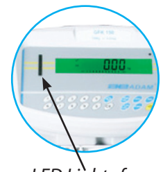
LED Lights for check weighing